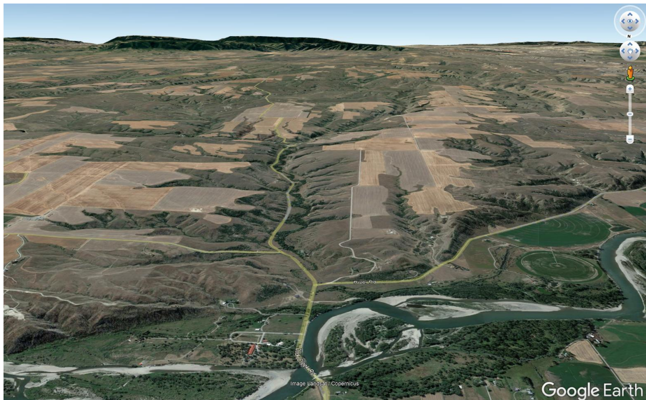
Google Earth image. Duck Creek Road is cutting through the middle of the photograph in a north to south direction. The Pryor Mountains are visible in the background. View is to the south.

Participants will examine outcrops and vistas along Duck Creek Road and observe structural relationships that show that these faults are normal faults most likely related to collapse of the basement-involved Bighorn/Pryor Mountains anticline. Oil and gas fields are set up by rollover anticlines that formed in the hanging walls of these faults.